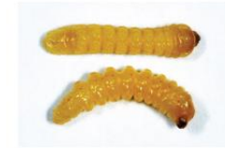
Figure 1. Decetes stem borer larvae.