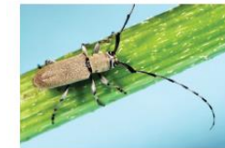
Figure 2. Adult Decetes stem borer.