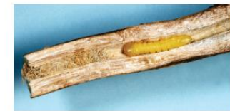
Figure 4. Decetes stem borer larva tunneling inside a soybean stem.