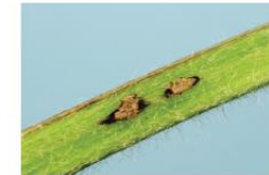
Figure 3. Egg scars on a soybean stem.